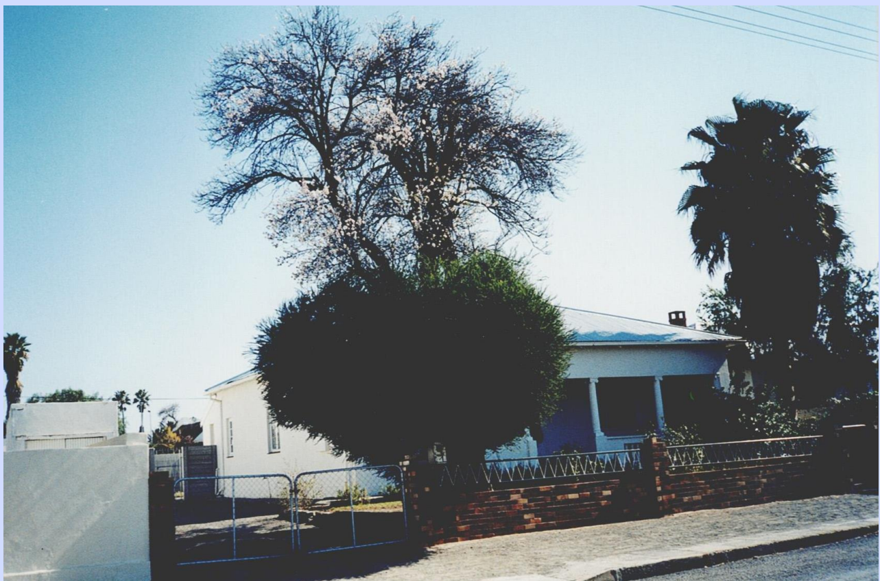
This is the Finkelstein residence at 144 Bird Street. Beaufort West